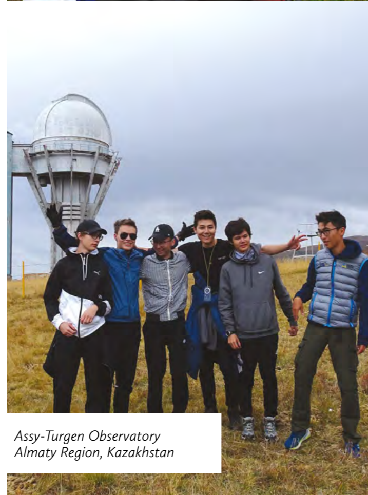
Assy-Turgen Observatory Almaty Region, Kazakhstan